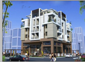
Shri Ram Sudha Complex.