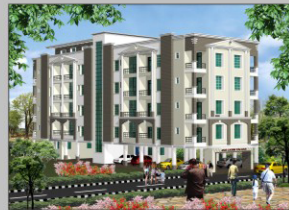
Jag Laxmi Palace