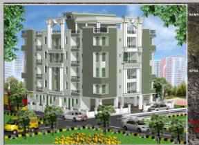
Rampari Prabha Apartment